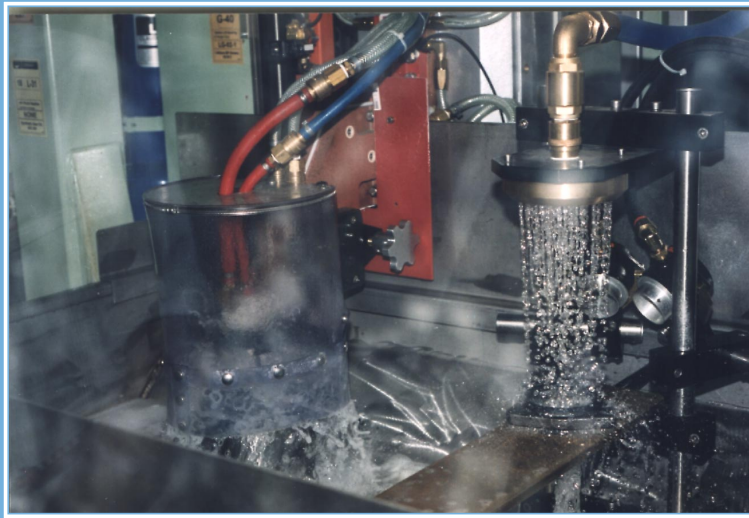
Picture showing the cooling process.

First shower (left) controlling the process, and the second shower (right), actually cooling down the piece of metal.