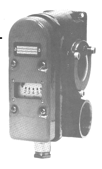
Other technical information will found in Catalogue SK 66-1 E.